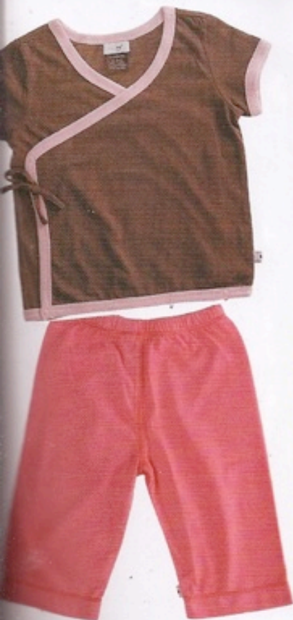
Left: MUDD KIDS Soy kimino top, $15.60 soy, petal pants, $15. Lightweight soy fibre breathes naturally and keeps its wearers cool in summer and warm in winter. www.muddkids.com.au