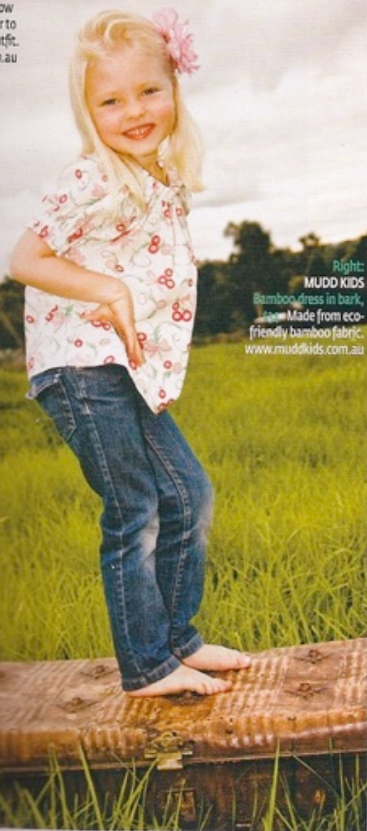
Right: MUDD KIDS Bamboo dress in bark, $40. Made from eco- friendly bamboo fabric. www.muddkids.com.au