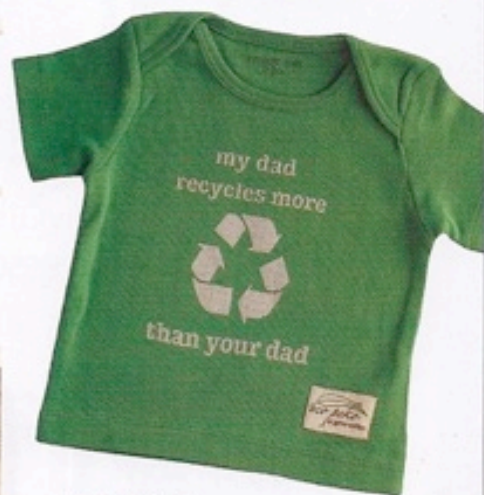
Above: ECO PEKO My Dad recycles more than your dad T-shirt, $39.95. In natural and retro green. www.ecopeko.com.au