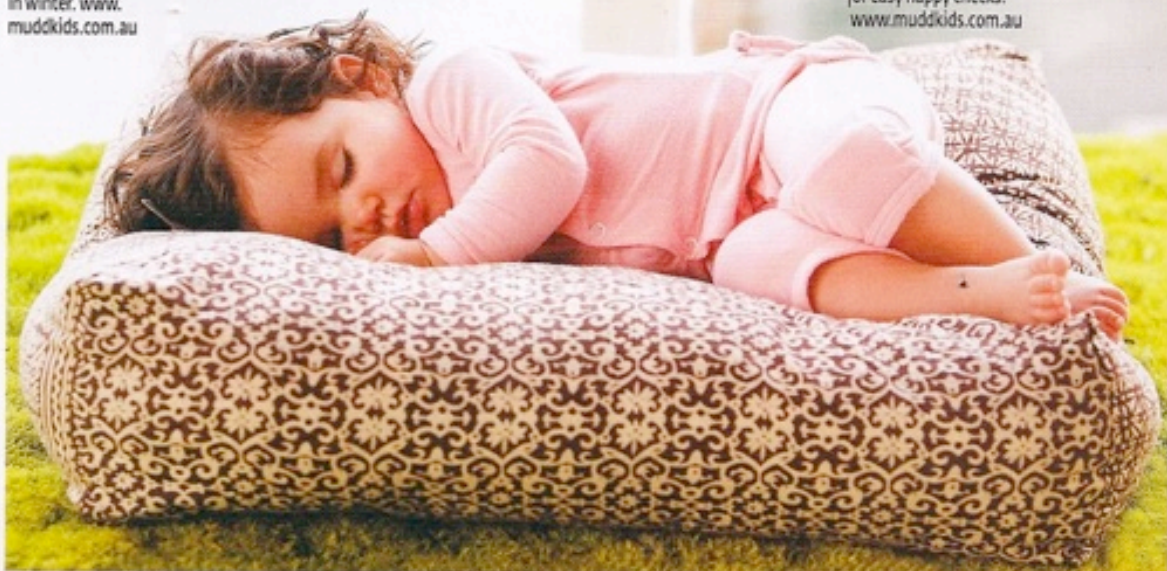
MUDD KIDS Bamboo jumpsuit in lotus pink, $30. Cute coverall with a drop-down butt for easy nappy checks. www.muddkids.com.au